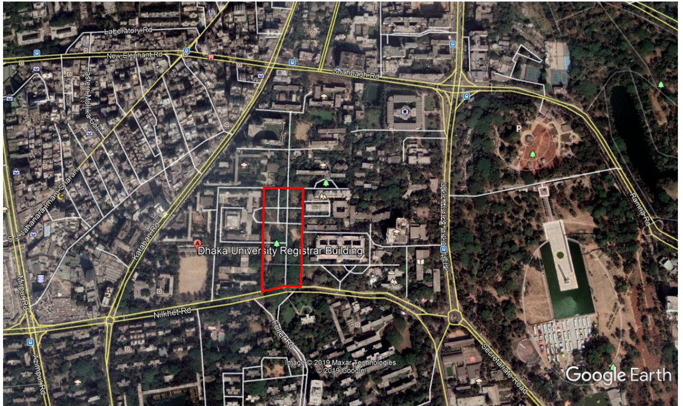
Photo: Google map of larger site surroundings