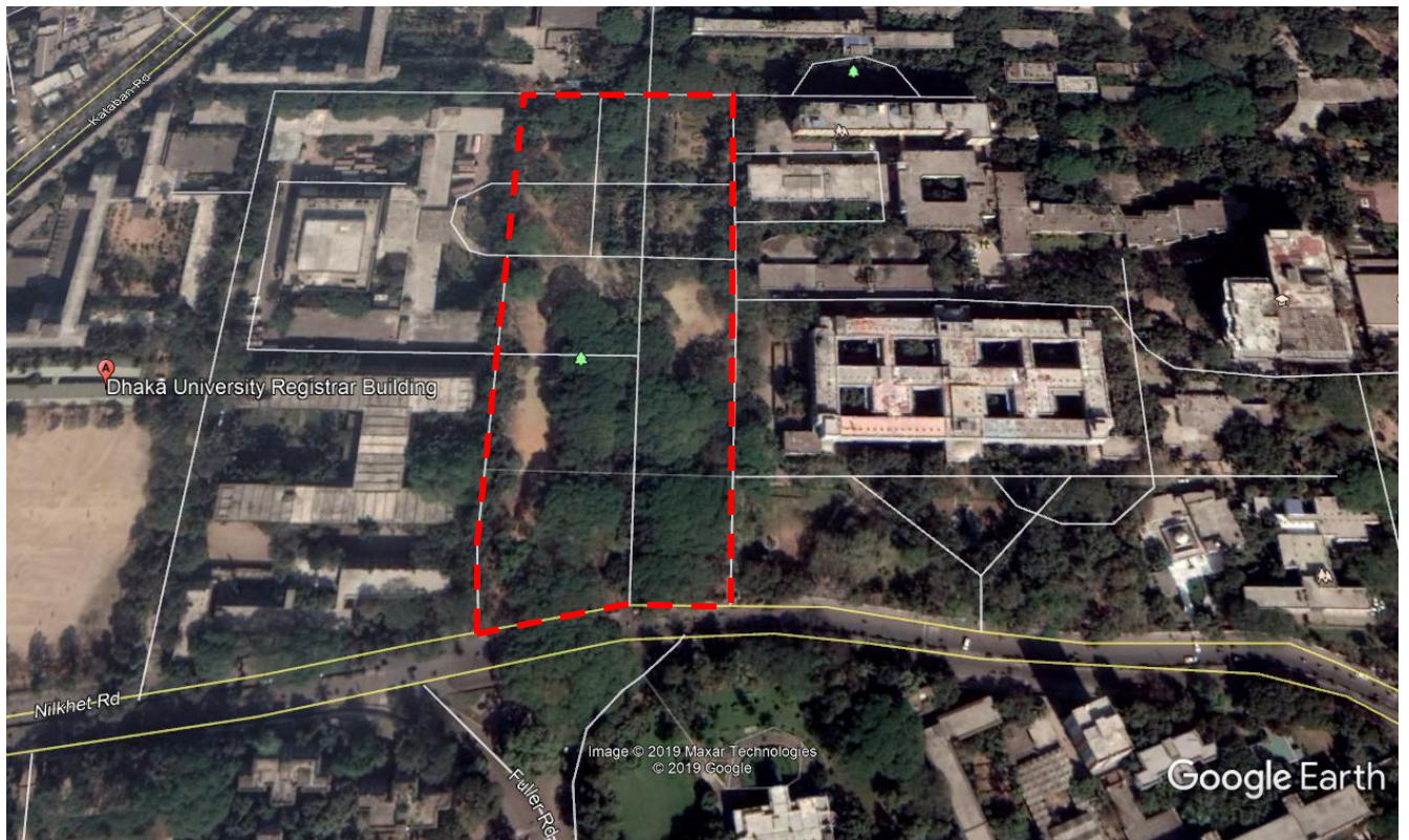
Photo: Google map of immediate site surroundings