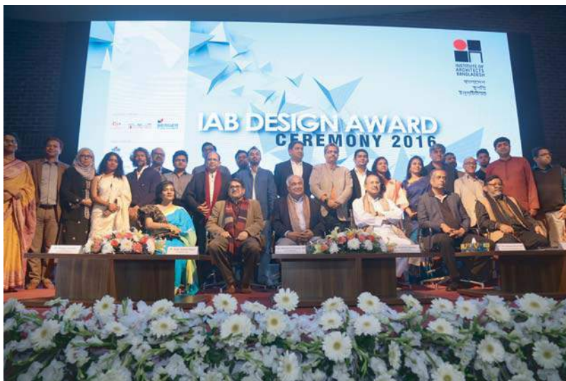
IAB Award 2016 winners