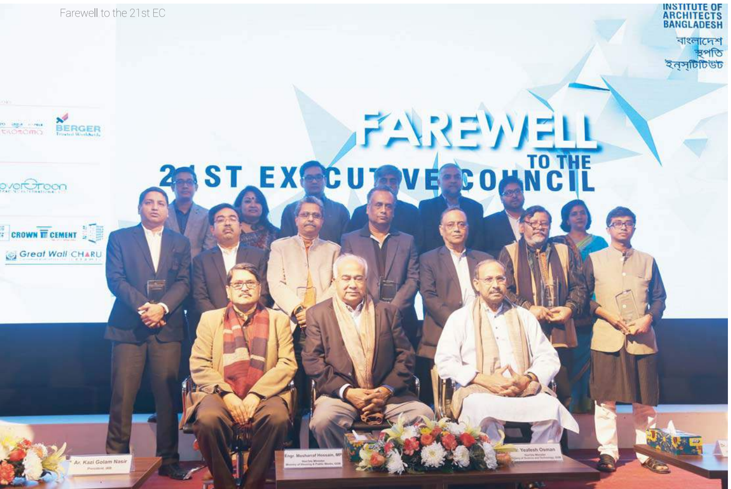
Farewell to the 21st EC

INSTITUTE OF ARCHITECTS BANGLADESH বাংলাদেশ স্থপতি ইনস্টিটিউট