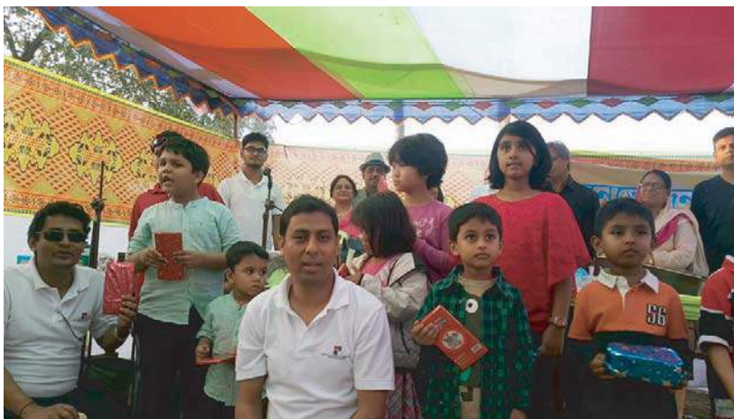
The Annual Picnic of Chittagong Chapter of IAB was held at the Chanpur Belgaon Tea Garden in Chittagong, on February 3, 2017. Architects and their family members and friends in total about 80 persons attended the picnic.