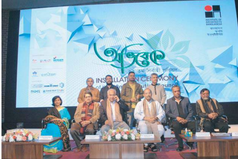
With the Election Commissioners