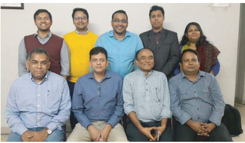
The newly elected 8th Chapter Committee of Chittagong Chapter of Institute of Architects Bangladesh.