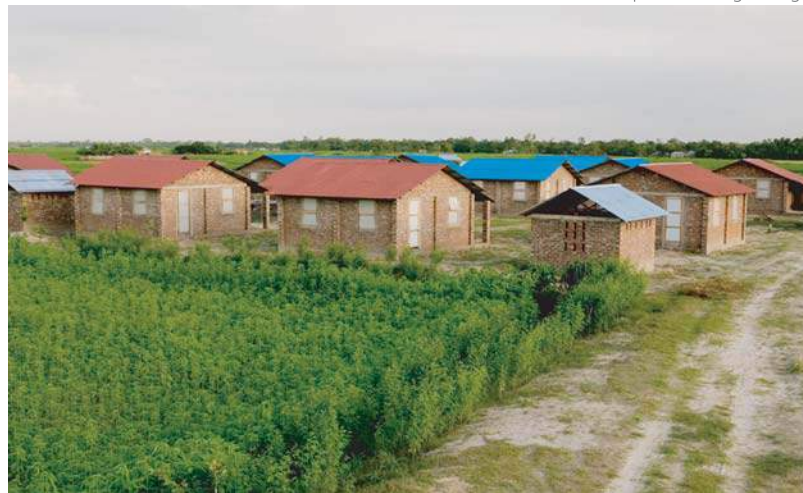
Winner in Residential-Multiple Housing category_ Disappearing lands: Supporting communities affected by river erosion

In addition, there were three Commendation Award winners in 'Commercial', 'Industrial' and 'Others' categories.