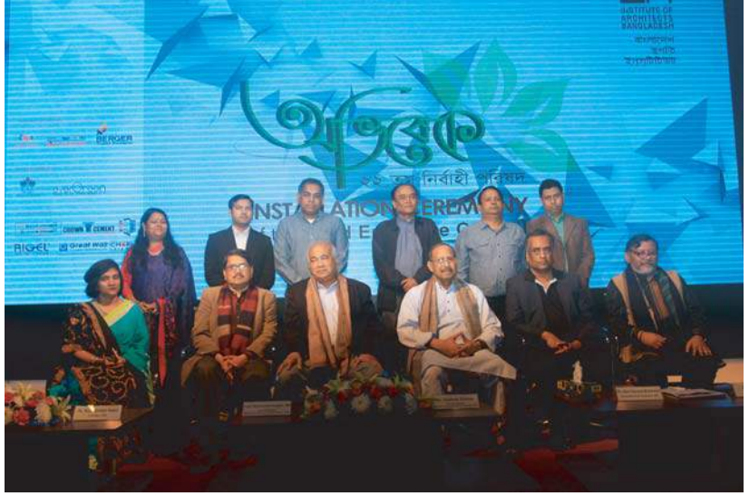
With the newly elected Members of the IAB Chittagong Chapter Committee