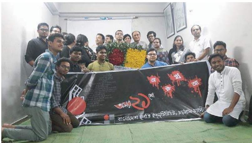
On the occasion of 'International Language Day', on February 21, 2017, at midnight, a contingent of architects, their family members and students of architecture, went to Central Shahid Minar in Chittagong, to place a floral wreath in memory of the martyrs of Language Movement. Before that, in the evening of February 20, 2017, at IAB Chittagong Office, there was a discussion on Language Movement and then there were recitations of poetries and presentation of patriotic songs by architects and students of architecture.