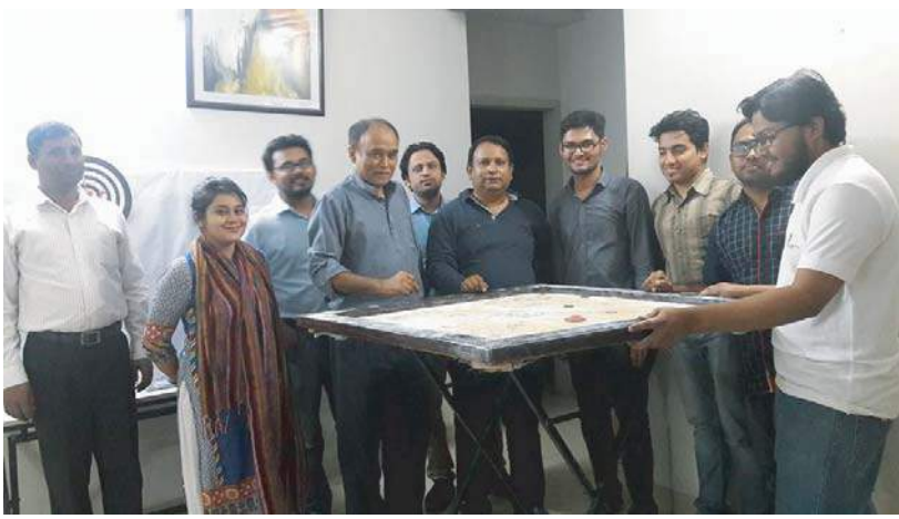
The 'Annual Indoor Game Tournament' of Chittagong Chapter of IAB, was held from February 8, 2017 to February 17, 2017 with enthusiasms and pomp. The prizes to the winners were given at the 'Installation Ceremony' on February 18, 2017.