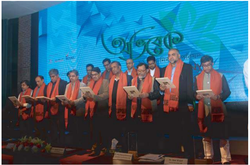
Members of the 22nd EC taking oath